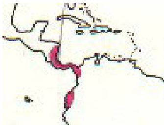
Former distribution of great green macaw. This area has now been reduced to small fragmentary populations in Nicaragua, Costa Rica, Panama, W. Colombia and W. Ecuador.

Like the majority of endangered animals, macaws also face serious pressure due to habitat loss. Powell et al. 1 estimate that the great green macaw breeding habitat in Costa Rica has been reduced by 90% in the last eight years and that loggers focus on the Dipteryx and Sacoglottis species for their hard wood. Macaws nest in tree cavities and are very selective when choosing a nesting location. The heartwood of many trees is dead and, in many rainforest individuals, is carved out by insects such as termites and wood boring beetles. A woodpecker may make a hole in the outer shell of the tree by prying for small arthropods or opening a doorway into a new home. Large birds routinely oust residents in tree cavities and enlarge the entrance. Macaws search for such conditions to raise their own young. Sometimes, the competition between macaw pairs for nest cavities is so fierce that they have been known to forcibly evict the resident pair and push their young out of the nest. When a poacher cuts a nest tree to extract the young, he/she damages the population with a double impact. The study concluded in their study that releasing great green macaws bred in captivity would not help the wild population because there is inadequate feeding and nesting habitats to sustain them. The best way to save this bird is to restore its native forest.