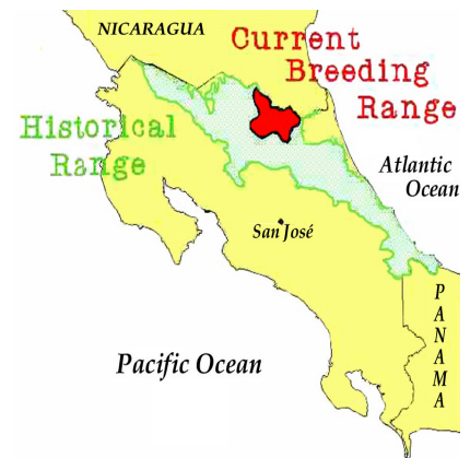
Historic breeding range of Great Green Macaws in Costa Rica (based upon anecdotal evidence) has been reduced by 90% to the current breeding range. (Taken from Powell et al. , 1999)